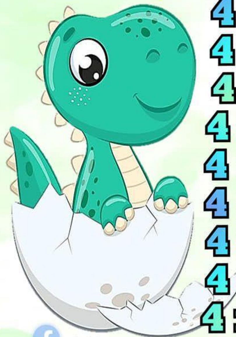
Tabla del 4