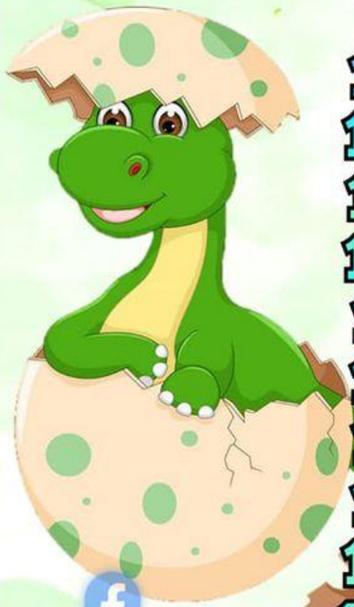
Tabla del 10