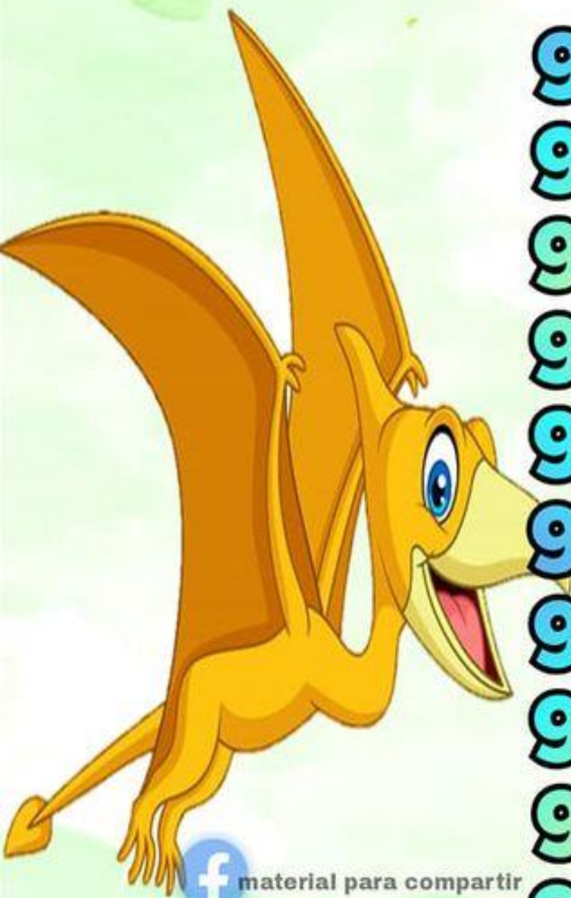
Tabla del 9